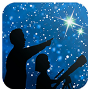
This article is distributed by NASA Night Sky Network The Night Sky Network program supports astronomy clubs across the USA dedicated to astronomy outreach. Visit nightsky.jpl.nasa.org to find local clubs, events, and more!