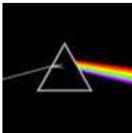
FIG. 3. Sample figure demonstrating that a bit-mapped image can be displayed as a figure.

to the figure as in “Figure ?? clearly shows ...” (whatever you wanted to point out). For manuscript typed on a typewriter or simple word processing program rather than typesetting software (such as \text{\TeX} ) it is entirely acceptable and appropriate to put the figures and tables on separate pages at the end of your paper. If you do so, be sure that they are labeled with figure and table numbers and proper captions.